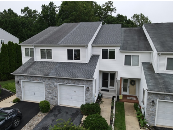
213 Johnce Road