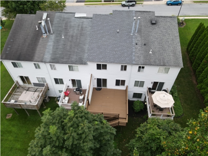
Rear of home with deck