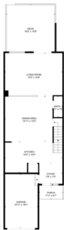
FLOOR PLAN CREATED BY CUBICASA API. MEASUREMENTS DEEMED HIGHLY RELIABLE BUT NOT GUARANTEED.