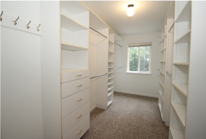
Primary Walk-In Closet