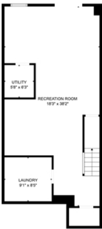
FLOOR PLAN CREATED BY CUBICASA API. MEASUREMENTS DEEMED HIGHLY RELIABLE BUT NOT GUARANTEED.