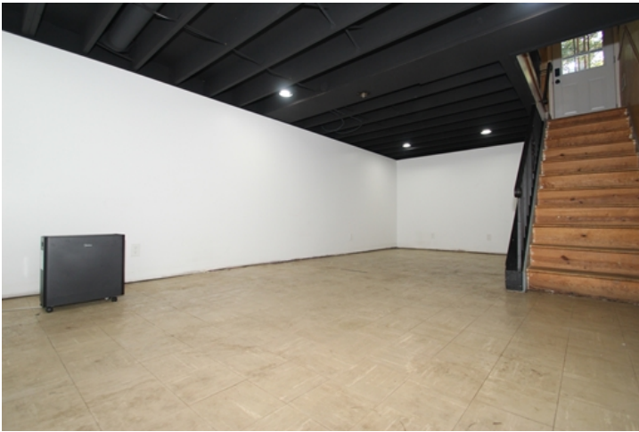
Family Room in basement