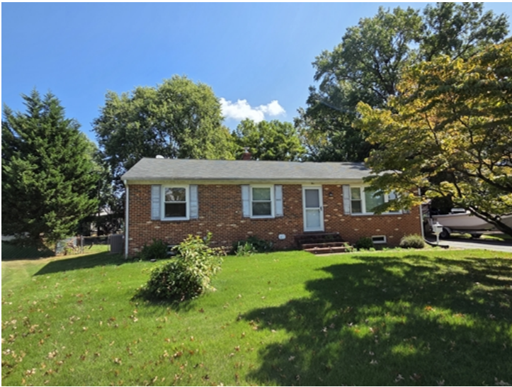
5 Stuyvesant Avenue