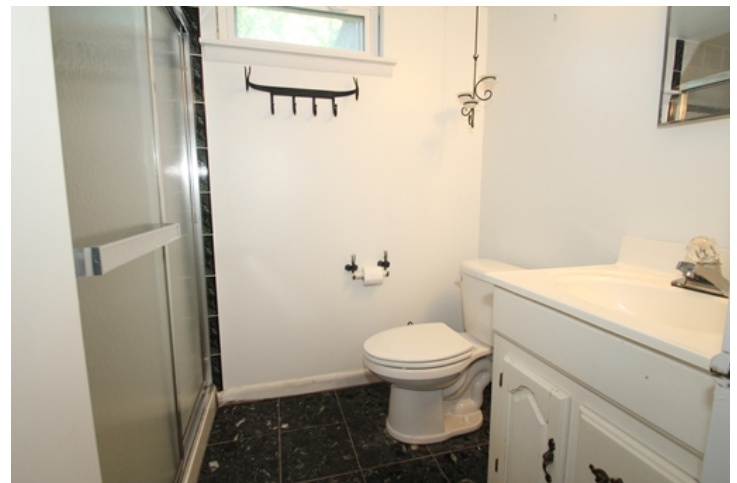
Full Bath in basement

Information set forth is deemed reliable, but there is no guarantee as to its accuracy and no warranties are made.