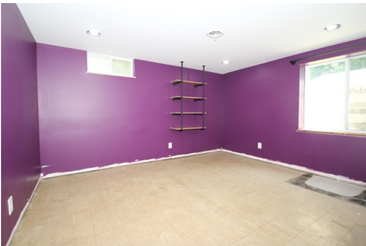
Bedroom with Egress