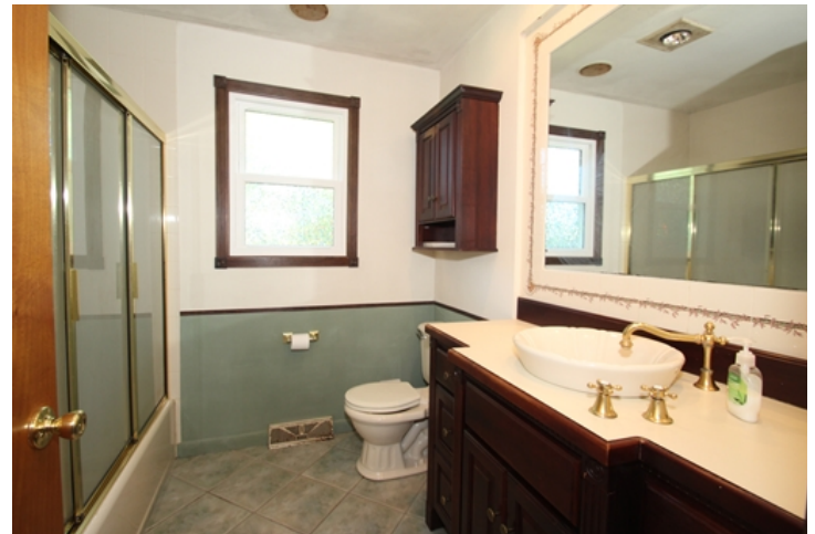
Main Level Full Bath